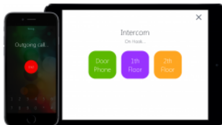
Intercom (iPad, iPhone)