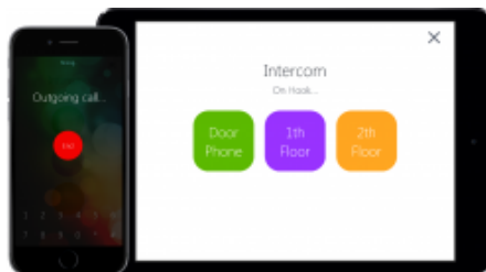
Intercom (iPad, iPhone)