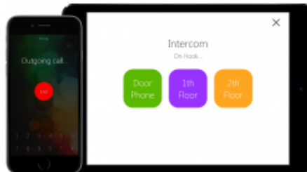
Intercom (iPad, iPhone)